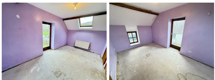
with radiator, front window and rear Velux window door to side wall.