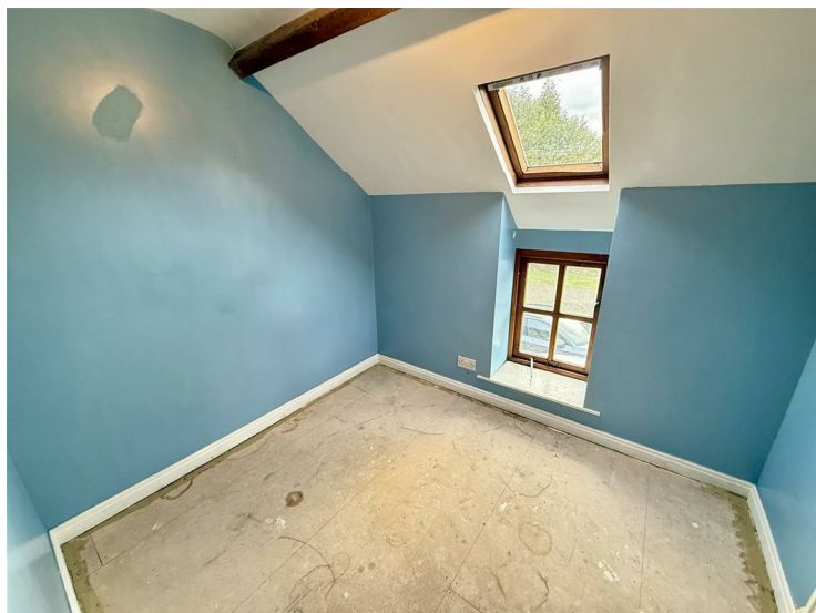
with front window and Velux radiator