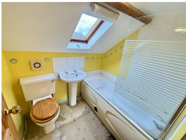
with bath having shower over, washbasin and toilet, extractor fan