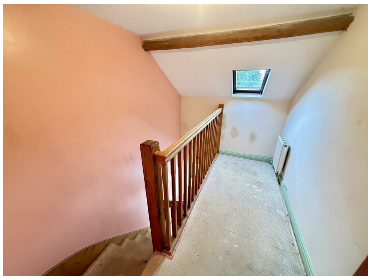
good sized study/landing with velux roof window, radiator